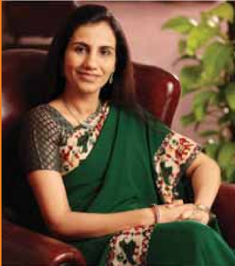
CHANDA D. KOCHHAR Managing Director & CEO